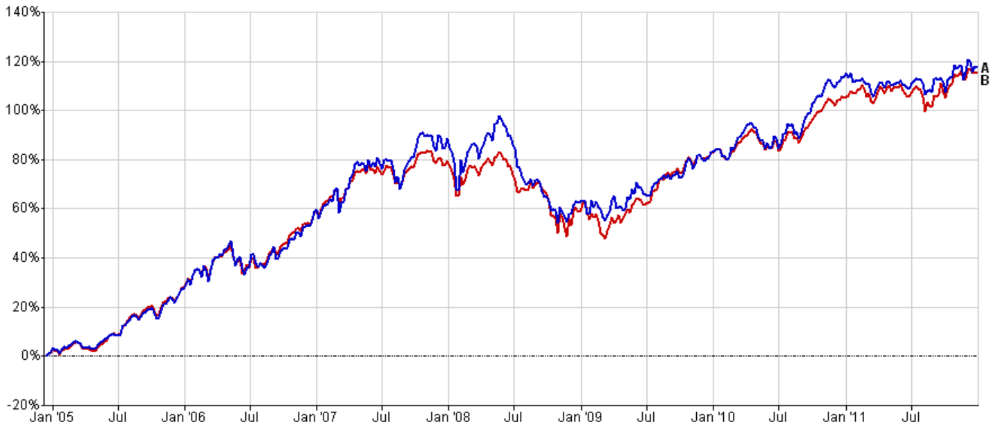
Total Return Bid-Bid line chart of Indequity Balanced Value Fund of Funds (since inception) and Domestic Asset Allocation Prud Med Eq Sector from South Africa Mutual universe

■ A - Indequity - Balanced Value Fund of Funds TR in ZA [117.76%] ■ B - SA Mt Domestic Asset Allocation Prud Med Eq TR in ZA [115.41%]