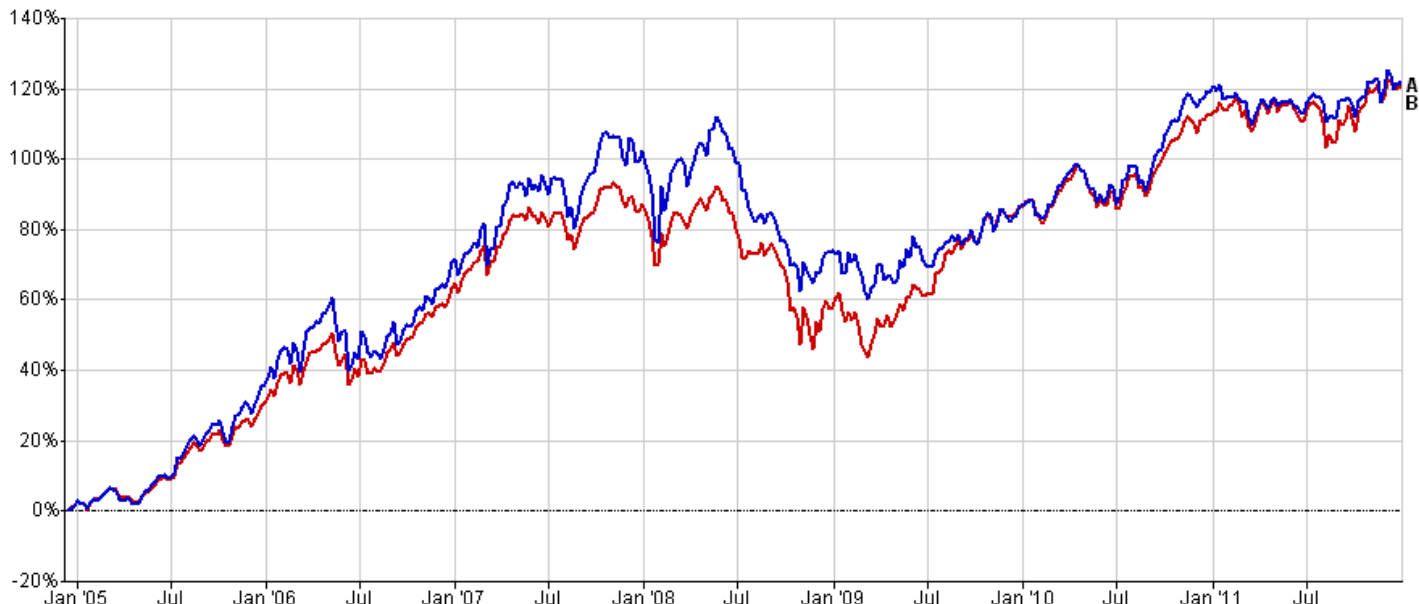
Total Return Bid-Bid line chart of Indequity Dynamic Fund of Funds (since inception) and Domestic Asset Allocation Prud High Eq Sector from South Africa Mutual universe

■ A - Indequity - Dynamic Fund of Funds TR in ZA [121.42%] ■ B - SA Mt Domestic Asset Allocation Prud High Eq TR in ZA [120.41%]